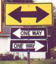
Signs can be confusing