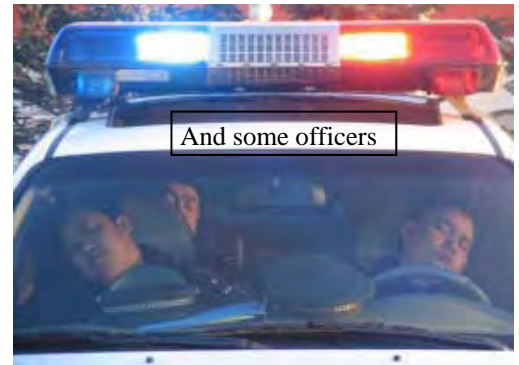
And some officers

A throne is only a bench covered with velvet. A man will fight harder for his interests than for his rights. A leader is a dealer in hope. An army marches on its stomach. A picture is worth a thousand words.