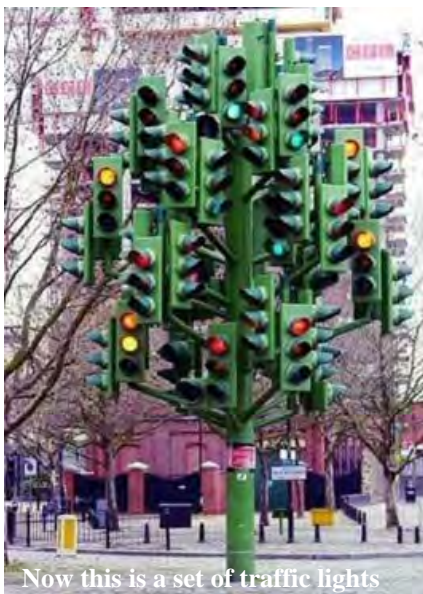
Now this is a set of traffic lights