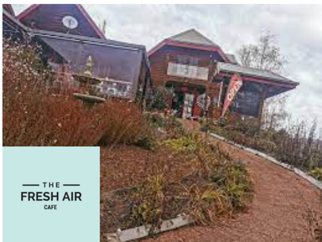
— THE — FRESH AIR CAFE

The time has not changed, it's 8:00- 10:00 am with the idea that it's something you can attend that does not get in the way of whatever else you have organised for the day.